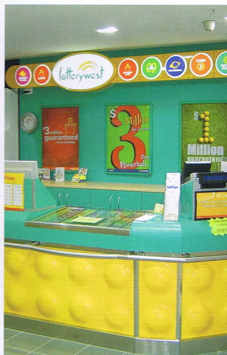
Miami Lotteries & News