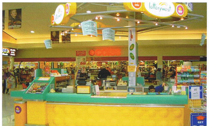
Ocean Keys Lottery Centre